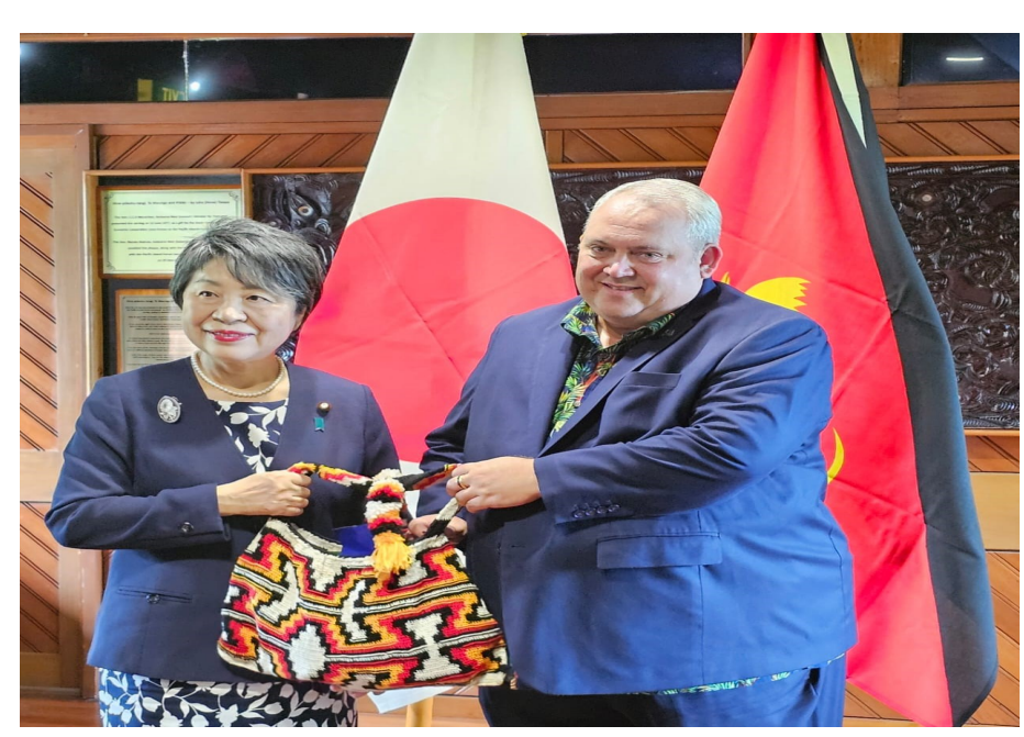
Minister Tkatchenko presenting gift (bilum) to Foreign Minister of Japan Yoko Kamikawa

contributor to the development needs and aspirations of the Pacific Island nations.