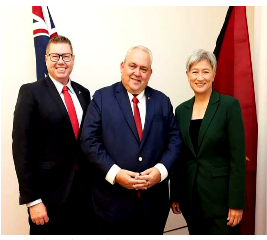
Minister Tkatchenko with the Australian Cabinet Ministers Hon. Pat Conroy and Senator Penny Wong

Minister Tkatchenko also took the opportunity to reassure both Senator Wong and Minister Conroy of the PNG Government's commitment to its traditional security partners in working with them to securing the peace and stability of the region, hence, dispelling the misinformation that PNG is entering into a security cooperation with the People's