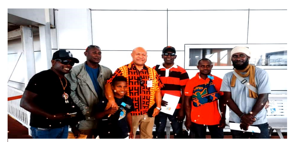
Mr. Bill Olmi, Papua New Guinea Acting High Commissioner to Fiji with the survivors

The Department of Foreign Affairs in collaboration with the Bougainville Disaster & Emergency Directorate, National Disaster Centre (NDC), and National Coordination Office of Bougainville Affairs (NCOBA) announced the successful repatriation of six (6) survivors of a sea voyage mishap, out of Tarawa, Kiribati and into Port Moresby, on Wednesday March 20, 2024.